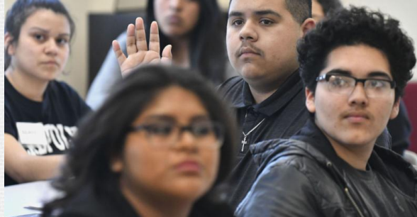
Students in a job-training session for youth answer questions on a Career pathways class. The teens will begin working at area businesses in April as part of a project aiming to keep youth off the streets and on a path to gainful employment.